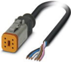
Sensor/Actuator cable, 6-position, PUR halogen-free, black-gray RAL 7021, free cable end, on Socket straight DEUTSCH DT06-6S Clip locking, Cable length: 5 m

Please be informed that the data shown in this PDF Document is generated from our Online Catalog. Please find the complete data in the user's documentation. Our General Terms of Use for Downloads are valid ( http://phoenixcontact.com/download )