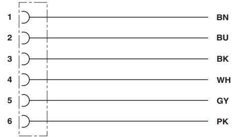
Contact assignment of the DEUTSCH DT06-6S