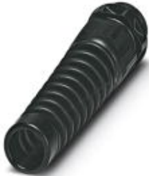
Cable gland, Cable gland material: Polyamide, Application: Standard, External cable diameter 9 mm ... 17 mm, Shielding: No, Connecting thread: M25

Please be informed that the data shown in this PDF Document is generated from our Online Catalog. Please find the complete data in the user's documentation. Our General Terms of Use for Downloads are valid ( http://phoenixcontact.com/download )