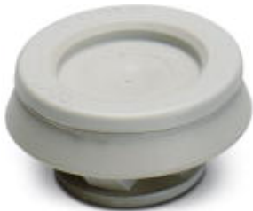
Membrane screw connection, Cable gland material: Polypropylene, Application: Standard, External cable diameter 9 mm ... 17 mm, Shielding: No, Connecting thread: M25, Color: lightgrey RAL 7035

Please be informed that the data shown in this PDF Document is generated from our Online Catalog. Please find the complete data in the user's documentation. Our General Terms of Use for Downloads are valid ( http://phoenixcontact.com/download )