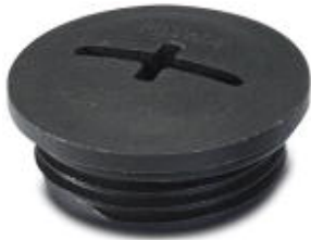
Screw plug, Cable gland material: Polyamide fiberglass reinforced, Connecting thread: M25, Color: black

Please be informed that the data shown in this PDF Document is generated from our Online Catalog. Please find the complete data in the user's documentation. Our General Terms of Use for Downloads are valid ( http://phoenixcontact.com/download )