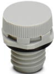
Pressure compensation element, Cable gland material: Polyamide, Polyamide, Connecting thread: M12, Color: light gray

Please be informed that the data shown in this PDF Document is generated from our Online Catalog. Please find the complete data in the user's documentation. Our General Terms of Use for Downloads are valid ( http://phoenixcontact.com/download )