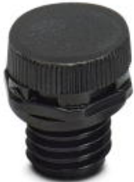
Pressure compensation element, Cable gland material: Polyamide, Polyamide, Connecting thread: M12, Color: black

Please be informed that the data shown in this PDF Document is generated from our Online Catalog. Please find the complete data in the user's documentation. Our General Terms of Use for Downloads are valid ( http://phoenixcontact.com/download )