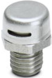
Pressure compensation element, Cable gland material: Stainless steel 1.4305, Stainless steel 1.4305, Connecting thread: M12, Color: silver

Please be informed that the data shown in this PDF Document is generated from our Online Catalog. Please find the complete data in the user's documentation. Our General Terms of Use for Downloads are valid ( http://phoenixcontact.com/download )