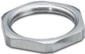
The figure shows version A-INL-M25-N-S

Counter nut, Cable gland material: Nickel-plated brass, Shielding: No, Connecting thread: 3/4 inch NPT, For threads 3/4 inch NPT, Color: silver