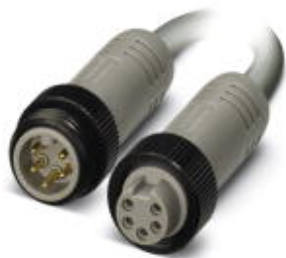
Bus system cable, DeviceNet™, 5-position, PVC, gray, Plug straight 7/8"-16UNF, A - standard, on Socket straight 7/8"-16UNF, A - standard, cable length: 15 m

Please be informed that the data shown in this PDF Document is generated from our Online Catalog. Please find the complete data in the user's documentation. Our General Terms of Use for Downloads are valid ( http://phoenixcontact.com/download )