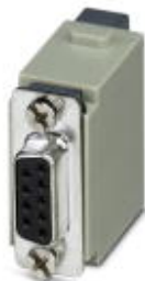
Contact insert module, Number of positions: 9, Type: D-SUB-9, Socket, Screw connection, 50 V, 1 A, 0.08 mm² ... 0.5 mm², Application: Data

Please be informed that the data shown in this PDF Document is generated from our Online Catalog. Please find the complete data in the user's documentation. Our General Terms of Use for Downloads are valid ( http://phoenixcontact.com/download )