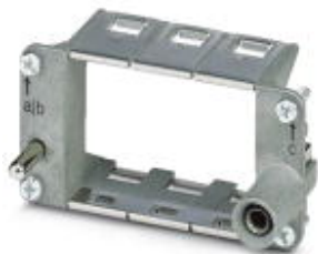
Module carrier frame, Size: B10, Type: for the panel mounting side (a, b, c, ...), 4 mm 2 ... 6 mm 2 , Application: Module carrier frame

Please be informed that the data shown in this PDF Document is generated from our Online Catalog. Please find the complete data in the user's documentation. Our General Terms of Use for Downloads are valid ( http://phoenixcontact.com/download )