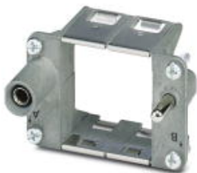
Module carrier frame, Size: B6, Type: for the sleeve side (A, B, C, ...), 4 mm 2 ... 6 mm 2 , Application: Module carrier frame

Please be informed that the data shown in this PDF Document is generated from our Online Catalog. Please find the complete data in the user's documentation. Our General Terms of Use for Downloads are valid ( http://phoenixcontact.com/download )