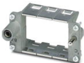
Module carrier frame, Size: B10, Type: for the sleeve side (A, B, C, ...), 4 mm 2 ... 6 mm 2 , Application: Module carrier frame

Please be informed that the data shown in this PDF Document is generated from our Online Catalog. Please find the complete data in the user's documentation. Our General Terms of Use for Downloads are valid ( http://phoenixcontact.com/download )