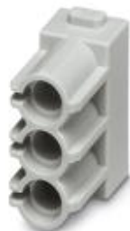
Contact insert module, Number of positions: 3, Socket/pin, Application: Pneumatics, for internal hose diameter of 1.6 / 3 / 4 mm

Please be informed that the data shown in this PDF Document is generated from our Online Catalog. Please find the complete data in the user's documentation. Our General Terms of Use for Downloads are valid ( http://phoenixcontact.com/download )