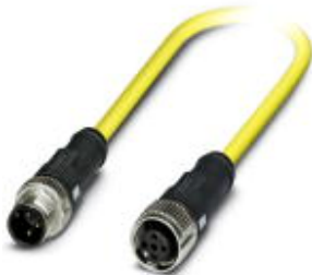
Sensor/Actuator cable, 3-position, PVC, yellow RAL 1021, Plug straight M12 SPEEDCON, A-coded, on Socket straight M12 SPEEDCON, A-coded, Cable length: 15 m

Please be informed that the data shown in this PDF Document is generated from our Online Catalog. Please find the complete data in the user's documentation. Our General Terms of Use for Downloads are valid ( http://phoenixcontact.com/download )