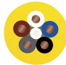
Cable cross section