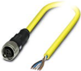
Sensor/Actuator cable, 5-position, PVC, yellow RAL 1021, free cable end, on Socket straight M12 SPEEDCON, A-coded, Cable length: 20 m

Please be informed that the data shown in this PDF Document is generated from our Online Catalog. Please find the complete data in the user's documentation. Our General Terms of Use for Downloads are valid ( http://phoenixcontact.com/download )