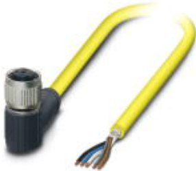
Sensor/Actuator cable, 5-position, PVC, yellow RAL 1021, shielded, free cable end, on Socket angled M12 SPEEDCON, A-coded, Cable length: 20 m

Please be informed that the data shown in this PDF Document is generated from our Online Catalog. Please find the complete data in the user's documentation. Our General Terms of Use for Downloads are valid ( http://phoenixcontact.com/download )