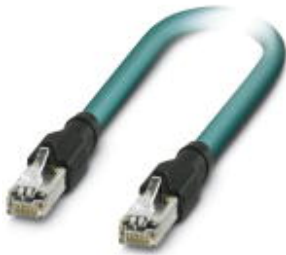
Patch cable, CAT5e, 4-pair, shielded, line, assembled at both ends with straight RJ45/IP20 heads, length: 1 m

Please be informed that the data shown in this PDF Document is generated from our Online Catalog. Please find the complete data in the user's documentation. Our General Terms of Use for Downloads are valid ( http://download.phoenixcontact.com )