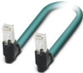
Patch cable, CAT5e, 4-pair, shielded, line, assembled at both ends with angled RJ45/IP20 heads, length: 5 m

Please be informed that the data shown in this PDF Document is generated from our Online Catalog. Please find the complete data in the user's documentation. Our General Terms of Use for Downloads are valid ( http://phoenixcontact.com/download )