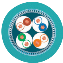
Ethernet, flexible, CAT5 [94B]