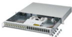
19" splice box, gray, 12 x LC duplex OM2

19" splice box, gray, 1 RU, fully pre-assembled ready to splice, for 12 x LC duplex OM2