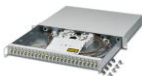
19" splice box, gray, 24 x LC duplex OM2

19" splice box, gray, 1 RU, fully pre-assembled ready to splice, for 24 x LC duplex OM2