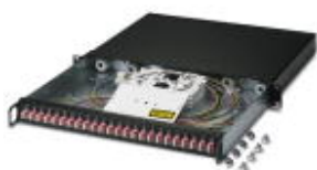
19" splice box, black, 24 x LC duplex OM4

19" splice box, black, 1 RU, fully pre-assembled ready to splice, for 24 x LC duplex OM4