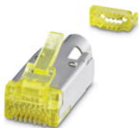
Male insert RJ45, CAT6A, 10 Gigabit

Please be informed that the data shown in this PDF Document is generated from our Online Catalog. Please find the complete data in the user's documentation. Our General Terms of Use for Downloads are valid ( http://phoenixcontact.com/download )