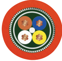
Sercos III [93K]