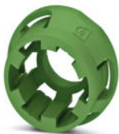
Fixing sleeve for M12 housing screw connection with tolerance-compensating function, for SMD-solderable M12 socket contact inserts.

Please be informed that the data shown in this PDF Document is generated from our Online Catalog. Please find the complete data in the user's documentation. Our General Terms of Use for Downloads are valid ( http://phoenixcontact.com/download )