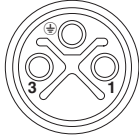
Pin assignment of M12 socket, 3-pos., S-coded, socket side view