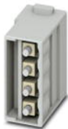
Contact insert module, number of positions: 4, Pin V, application: FO, for integration of up to 4 LC simplex connectors

Please be informed that the data shown in this PDF Document is generated from our Online Catalog. Please find the complete data in the user's documentation. Our General Terms of Use for Downloads are valid ( http://phoenixcontact.com/download )