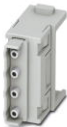
Contact insert module, number of positions: 4, Socket V, application: FO, with 4 ceramic ferrules

Please be informed that the data shown in this PDF Document is generated from our Online Catalog. Please find the complete data in the user's documentation. Our General Terms of Use for Downloads are valid ( http://phoenixcontact.com/download )