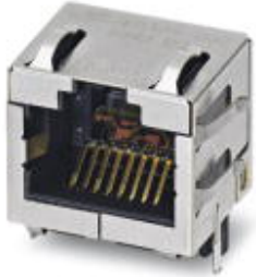
RJ45 socket insert, for PCB assembly, CAT6 A , 8-pos., shielded, with angled solder pins, 1x

Please be informed that the data shown in this PDF Document is generated from our Online Catalog. Please find the complete data in the user's documentation. Our General Terms of Use for Downloads are valid ( http://download.phoenixcontact.com )