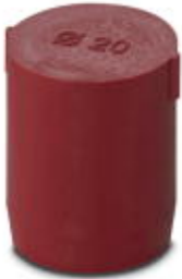
Closing cap, PA, color: red

Please be informed that the data shown in this PDF Document is generated from our Online Catalog. Please find the complete data in the user's documentation. Our General Terms of Use for Downloads are valid ( http://phoenixcontact.com/download )