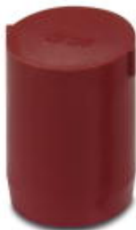
Closing cap, PA, color: red

Please be informed that the data shown in this PDF Document is generated from our Online Catalog. Please find the complete data in the user's documentation. Our General Terms of Use for Downloads are valid ( http://phoenixcontact.com/download )