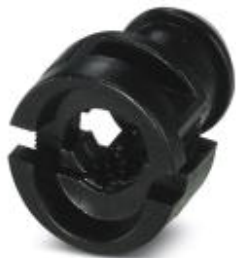
Protective hose adapter, for corrugated hoses with a nominal size of 13 (10 x 13), corrugated in parallel

Please be informed that the data shown in this PDF Document is generated from our Online Catalog. Please find the complete data in the user's documentation. Our General Terms of Use for Downloads are valid ( http://phoenixcontact.com/download )