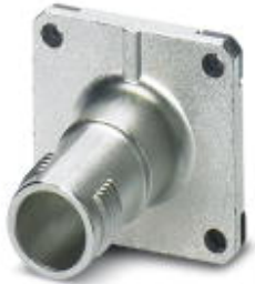
Flange housing, 25 mm x 25 mm

Please be informed that the data shown in this PDF Document is generated from our Online Catalog. Please find the complete data in the user's documentation. Our General Terms of Use for Downloads are valid ( http://download.phoenixcontact.com )