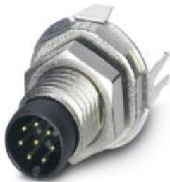
Sensor/actuator flush-type plug-in connector, plug, 8-pos., M8, rear/screw mounting with M8 fastening thread, with straight solder connection

Please be informed that the data shown in this PDF Document is generated from our Online Catalog. Please find the complete data in the user's documentation. Our General Terms of Use for Downloads are valid ( http://download.phoenixcontact.com )