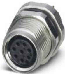
Sensor/actuator flush-type plug-in connector, socket, 8-pos. M8, rear/screw mounting with M10 fastening thread, with straight solder connection

Please be informed that the data shown in this PDF Document is generated from our Online Catalog. Please find the complete data in the user's documentation. Our General Terms of Use for Downloads are valid ( http://download.phoenixcontact.com )