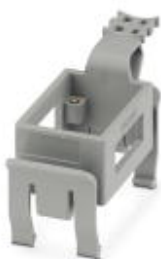
HEAVYCON DIN rail mounting frame, for type B6 contact inserts

Please be informed that the data shown in this PDF Document is generated from our Online Catalog. Please find the complete data in the user's documentation. Our General Terms of Use for Downloads are valid ( http://phoenixcontact.com/download )