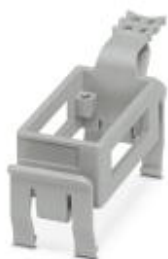
HEAVYCON DIN rail mounting frame, for type B10 contact inserts

Please be informed that the data shown in this PDF Document is generated from our Online Catalog. Please find the complete data in the user's documentation. Our General Terms of Use for Downloads are valid ( http://phoenixcontact.com/download )