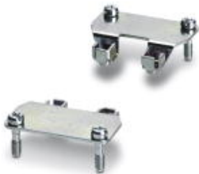
Adapter insert, type: D25

Please be informed that the data shown in this PDF Document is generated from our Online Catalog. Please find the complete data in the user's documentation. Our General Terms of Use for Downloads are valid ( http://phoenixcontact.com/download )