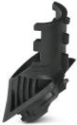
Strain relief, type: B6 - B24

Please be informed that the data shown in this PDF Document is generated from our Online Catalog. Please find the complete data in the user's documentation. Our General Terms of Use for Downloads are valid ( http://phoenixcontact.com/download )