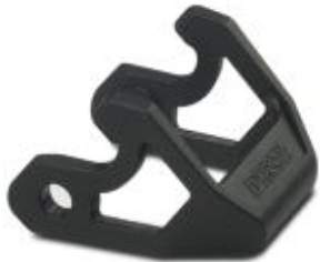
Replacement latch for HC-D7 housing

Please be informed that the data shown in this PDF Document is generated from our Online Catalog. Please find the complete data in the user's documentation. Our General Terms of Use for Downloads are valid ( http://phoenixcontact.com/download )