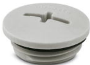
Screw plug, cable gland material: PA, PA, connecting thread: M20 x 1.5, color: lightgrey RAL 7035, with O-ring

Please be informed that the data shown in this PDF Document is generated from our Online Catalog. Please find the complete data in the user's documentation. Our General Terms of Use for Downloads are valid ( http://phoenixcontact.com/download )