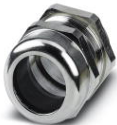
Cable gland, cable gland material: Nickel-plated brass, external cable diameter 37 mm ... 53 mm, shielding: no, connecting thread: M63 x 1.5, color: silver, with O-ring

Please be informed that the data shown in this PDF Document is generated from our Online Catalog. Please find the complete data in the user's documentation. Our General Terms of Use for Downloads are valid ( http://phoenixcontact.com/download )