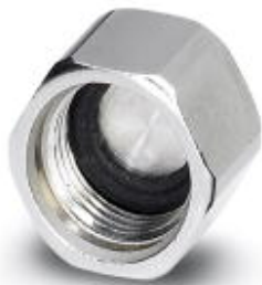
M12 metal sealing cap for unoccupied M12 plugs of the sensor/actuator cable, flush-type plugs and I/O devices in the field

Please be informed that the data shown in this PDF Document is generated from our Online Catalog. Please find the complete data in the user's documentation. Our General Terms of Use for Downloads are valid ( http://phoenixcontact.com/download )