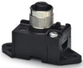
AS-Interface distributor with IP67 protection for one flat-ribbon conductor, with a straight, A-coded, 2-pos. M12 socket

Please be informed that the data shown in this PDF Document is generated from our Online Catalog. Please find the complete data in the user's documentation. Our General Terms of Use for Downloads are valid ( http://phoenixcontact.com/download )