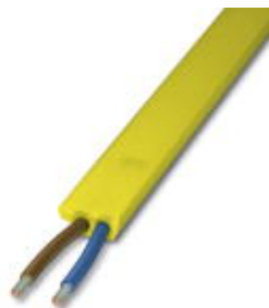
AS-Interface TPE flat conductor with UL in yellow, 2 x 1.5 mm 2 , 1000 m on disposable drum

Please be informed that the data shown in this PDF Document is generated from our Online Catalog. Please find the complete data in the user's documentation. Our General Terms of Use for Downloads are valid ( http://phoenixcontact.com/download )