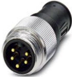
DeviceNet termination resistor, 5-pos., 7/8"-UNF connector

Please be informed that the data shown in this PDF Document is generated from our Online Catalog. Please find the complete data in the user's documentation. Our General Terms of Use for Downloads are valid ( http://download.phoenixcontact.com )