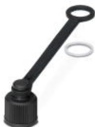
M8 sealing cap made of plastic with fixing band, for free M8 connectors, with 7.5 mm fastening eye

Please be informed that the data shown in this PDF Document is generated from our Online Catalog. Please find the complete data in the user's documentation. Our General Terms of Use for Downloads are valid ( http://phoenixcontact.com/download )