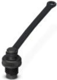
M8 sealing cap made of plastic with fixing band, for free M8 sockets, with 3.0 mm fastening eye

Please be informed that the data shown in this PDF Document is generated from our Online Catalog. Please find the complete data in the user's documentation. Our General Terms of Use for Downloads are valid ( http://download.phoenixcontact.com )