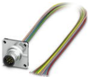
Sensor/Actuator flush-type plug, 8-pos., M12, A-coded, front/square flange mounting, with 0.5 m TPE litz wire, 8 x 0.25 mm 2

Please be informed that the data shown in this PDF Document is generated from our Online Catalog. Please find the complete data in the user's documentation. Our General Terms of Use for Downloads are valid ( http://phoenixcontact.com/download )